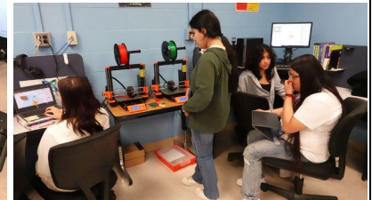
Moments in FUSE: Collaborating on Gel Chemistry (upper left), coding a robot (lower left), sharing a cookie cutter design & successful 3D print (center); working on a marble roller coaster (upper right); designing and 3D printing in FUSE (lower right, with 3D printers)

STEM Scale-Up Program Application Link: www.IowaSTEM.org/Scale-Up-Application